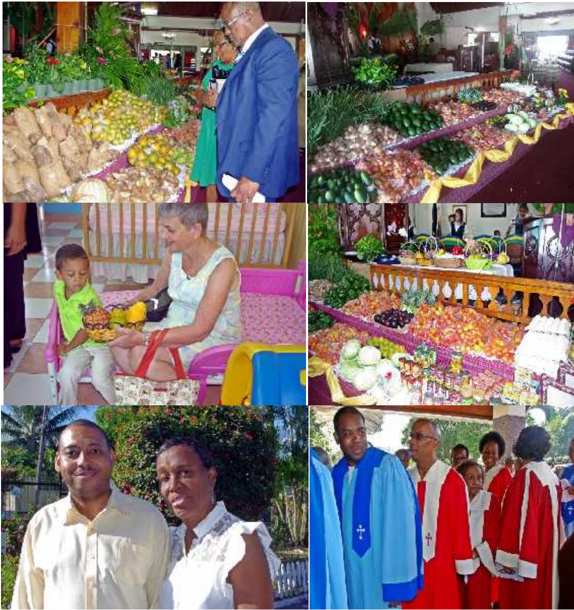
Harvest was celebrated on Sunday the 22 nd of February 2015